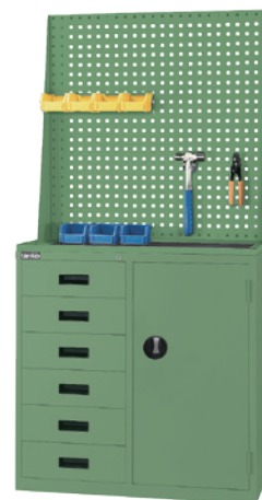
EF-33DW+KQ62 H1788xW900xD465 Drawer: 130x6 With 1 panel set and 2 shelves ※ Tools are not included in the product 55pcs/20ft 110pcs/40ft Shelf loading capacity:100Kg