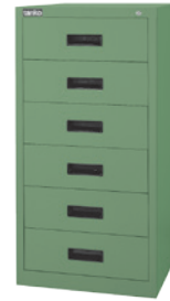
EF-13W H880xW450xD452 Drawer: 130x6 110pcs/20ft 220pcs/40ft