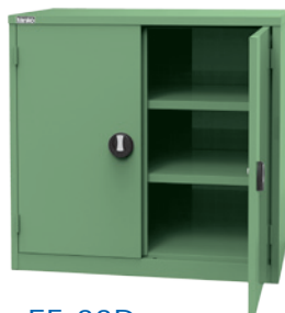
EF-33D H880xW900xD465 With 2 shelves 55pcs/20ft 110pcs/40ft Shelf loading capacity:200Kg