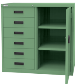
EF-33DW H880xW900xD465 Drawer: 130x6 With 2 shelves 55pcs/20ft 110pcs/40ft Shelf loading capacity:100Kg