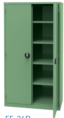
EF-36D H1760xW900xD465 With 4 shelves 28pcs/20ft 55pcs/40ft Shelf loading capacity:200Kg