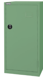
EF-13D H880xW450xD465 With 2 shelves 110pcs/20ft 220pcs/40ft Shelf loading capacity:100Kg